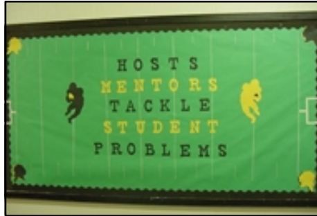
The mentor bulletin board at Broken Bow's Middle School.

gram has helped us to gain a new respect for our teachers, as well as ourselves. We have learned that a great deal of patience, kind-