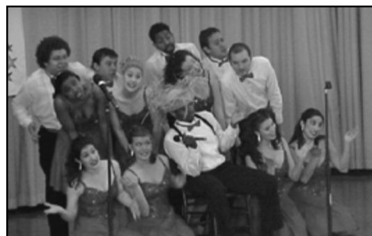
The Chorvettes Stageworks Company performing "The Benjamin Calypso" from Joseph and the Amazing Technicolor Dreamcoat.

After the rousing final number— Oklahoma! —students had the opportunity to meet and talk to the members of the